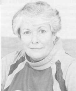
Jean Sutherland Boggs

with External Affairs, where he was Assistant Director of the Regional Passport Office in Montreal.