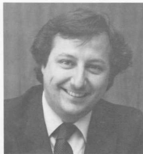
. . . and to Alain Gourd , who now takes on the responsibilities of Deputy Minister of Communications.